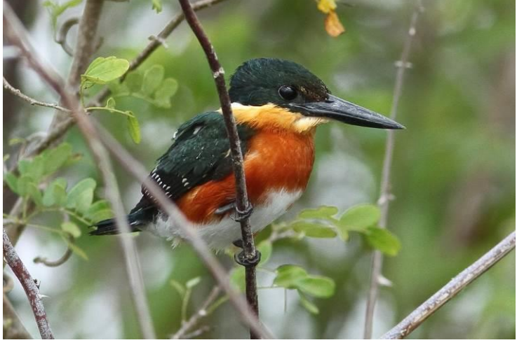
American Pygmy Kingfisher