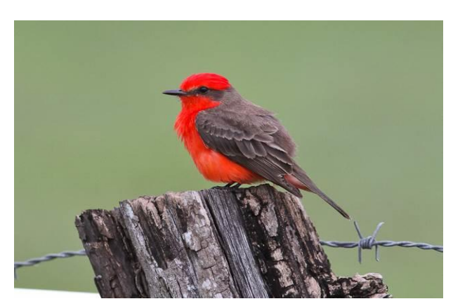
Vermilion Flycatcher

NIGHT: Bird's Eye View Lodge, Crooked Tree Wildlife Sanctuary