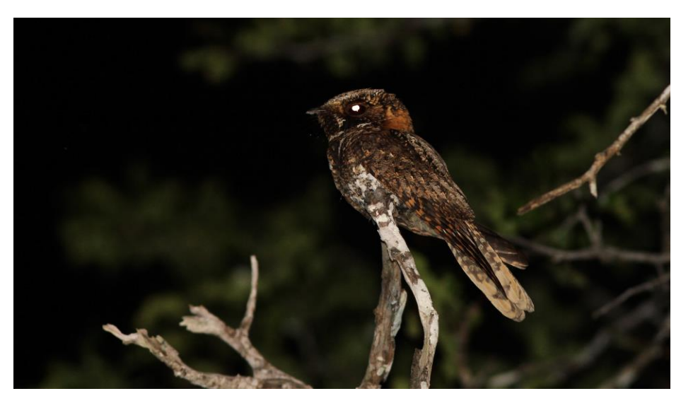
Yucatan Nightjar

March 17-19, Days 5-7: Lamanai. We'll spend the next three days exploring the trails, clearings, and ruins at Lamanai. Here we'll experience some of the finest tropical forest birding in Belize. A stroll through forest may produce trails Blue Ground-Dove; Long-billed and Stripe-throated hermits; Blackheaded. Slaty-tailed and Gartered trogons; Whitewhiskered Puffbird: Keel-billed Toucan; Chestnut-colored Woodpecker; Tawny-winged and Ivory-billed woodcreepers; Barred Antshrike; Northern Bentbill; a long list of wintering