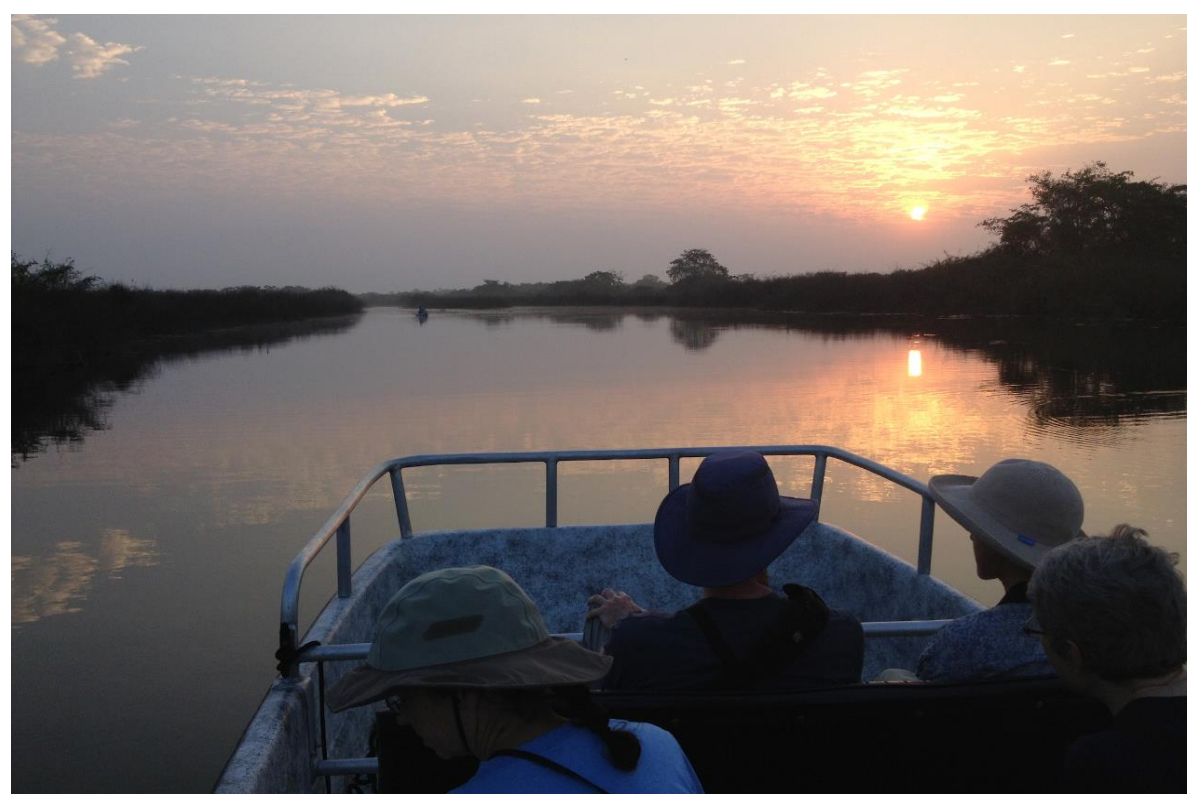
Cruising the New River

and migrant warblers; Black-throated Shrike-Tanager; Red-throated Ant-Tanager; and Yellow-throated and Olive-backed euphonias. Beyond birds, there are always other interesting creatures here such as howler monkeys, agoutis, coatis, lizards, and a host of dazzling butterflies. A cocktail cruise on the river will be a relaxing way to watch the sun set and perhaps see a few new birds. For those who wish, one evening after dinner we'll do a river cruise, to search for interesting nocturnal species. This gives us the opportunity to see some night birds such as Northern Potoo, Yucatan Nightjar, Common Pauraque, and Mottled Owl, and is also the best chance we'll have to see other secretive creatures, like Morelet's Crocodile, or even a Jaguar.