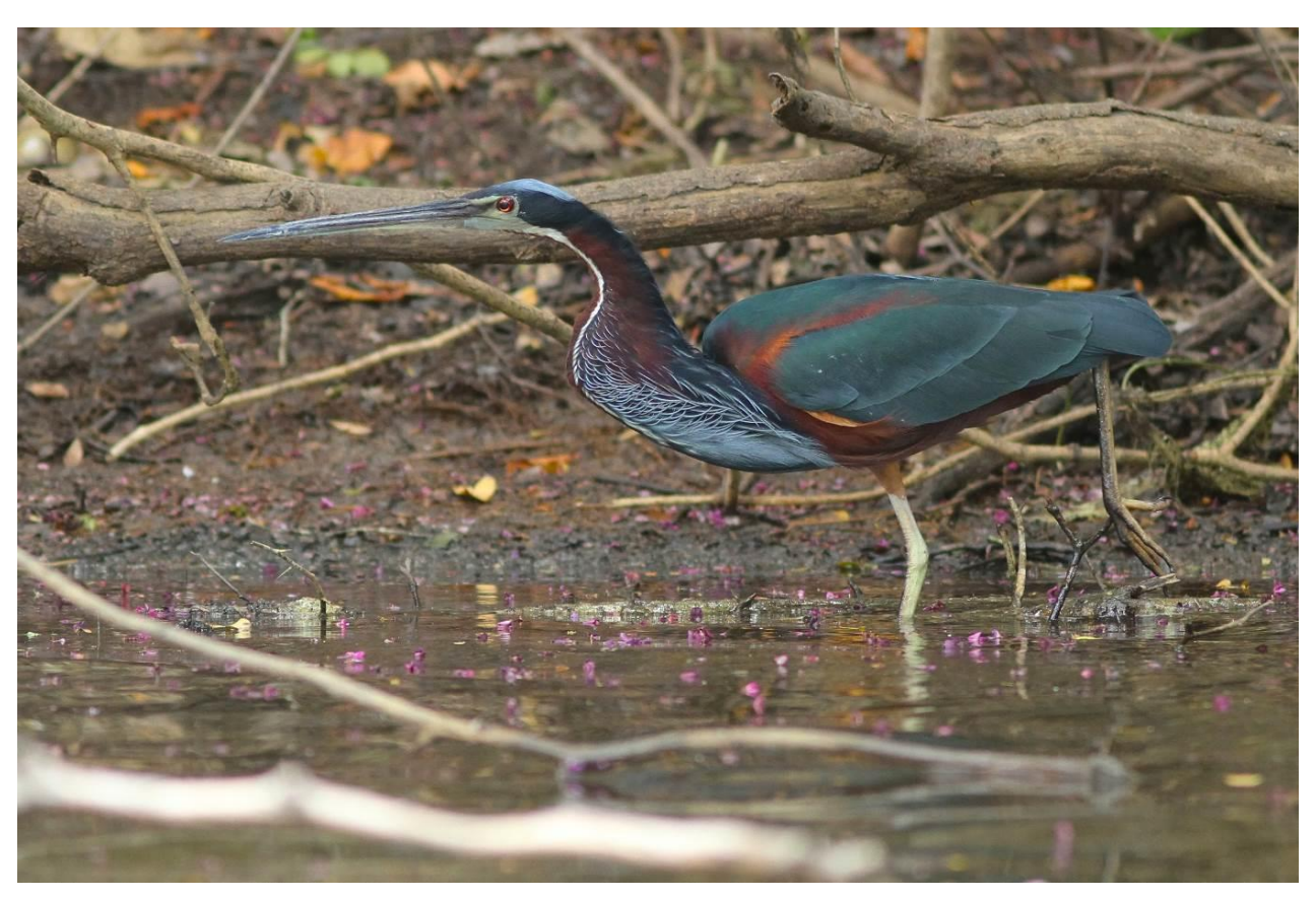
Agami Heron

This tour offers an exciting introduction to natural history exploration in the Neotropics. The two elements of this tour are very different and together sample much of this charming country's diverse habitats. In both areas, our accommodations are very comfortable and our schedule flexible enough to accommodate those who wish to take time away from the group. Our "Relaxed & Easy" style is appropriate for participants who want a slower paced experience, with lighter physical activity and more ample siesta time than other tours. For those who want more birding time, an optional early morning outing will be offered before breakfast each day.