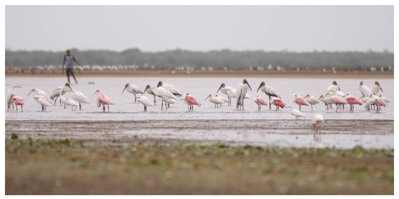
Waders at Crooked Tree Lagoon

in search of several Yucatan specialties such as Yellow-lored Parrot, Yucatan Woodpecker, Yucatan Flycatcher, and Yucatan Jay. In this birdy area, we should expect to be constantly entertained by various parrots, flycatchers, warblers, tanagers, and other species.